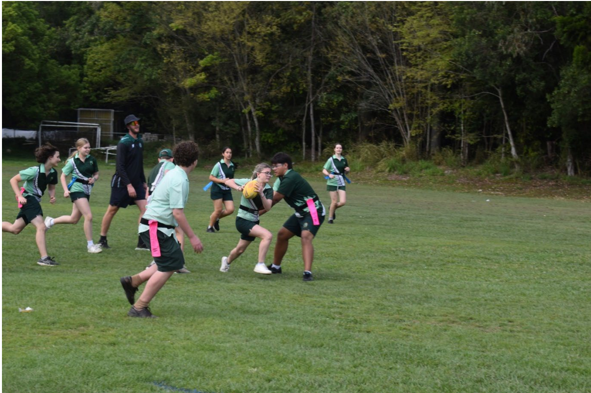
HPE Week 2024 – Ferny Grove SHS

In 2024, we moved the event to September to align with ACHPER Australia's National HPE Day and 32 schools registered for the event.